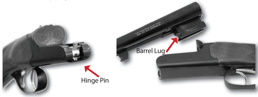
Fig. 6 Fig. 7

8. Assemble the forend to the barrel assembly (refer to Assembling forend to Barrel Assembly, page 14).